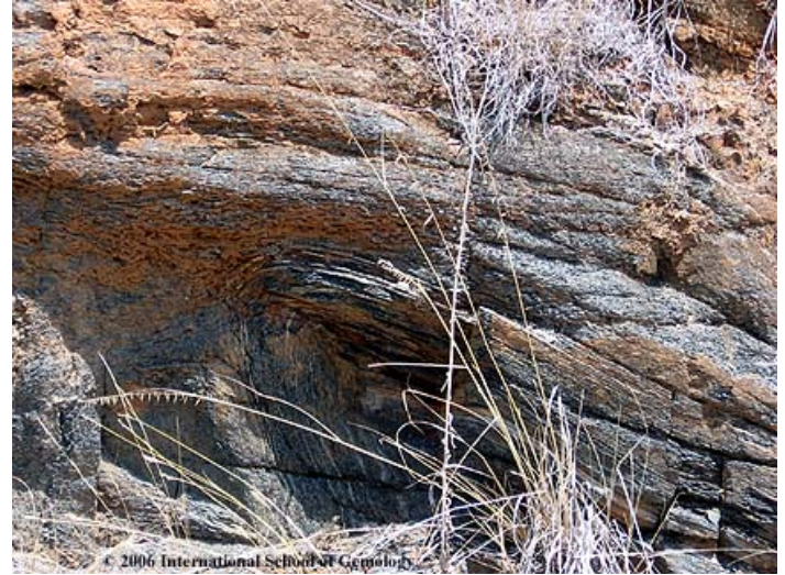
Above shows the incredible stress and pressure that pegmatite intrusions exert on the existing rock. Here you can see where the strata of the rock has been bent beyond a 90 degree angle by the pegmatite intruding into it and bending it out of the way.