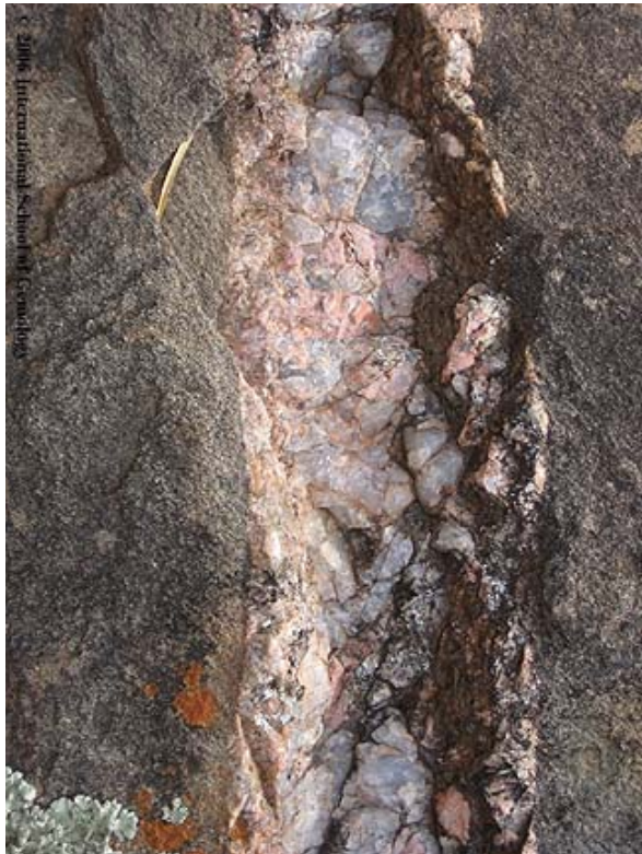
Above: Shows the white pegmatite quartz with pink feldspar crystals formed along the contact zone. It is at this contact zone that many colored gemstone crystals such as amethyst, citrine, tourmaline and others would be found.