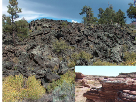
Lava fields in the Bonito Campground